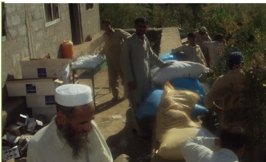
Beneficiaries receiving Agriculture Inputs