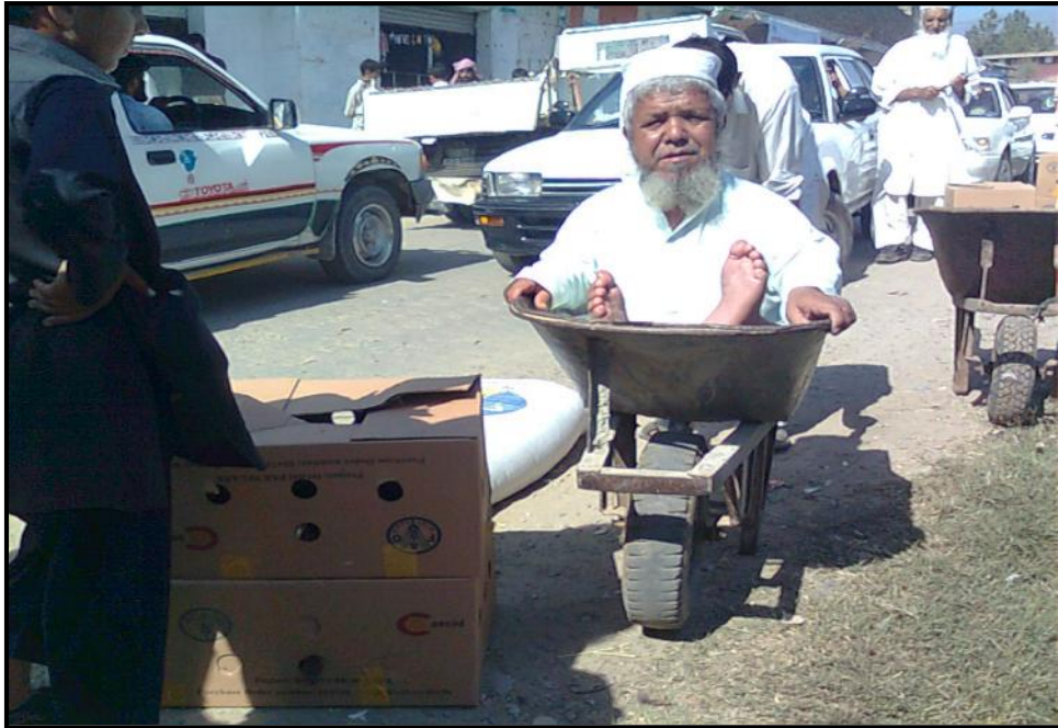
A Disabled person has received Poultry Package