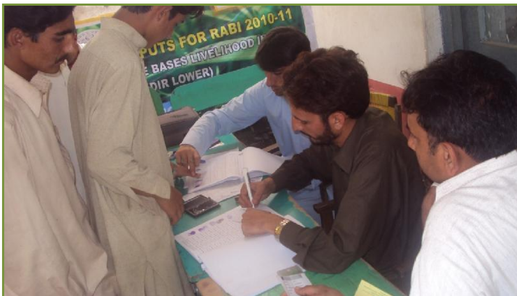
Verification of Beneficiaries